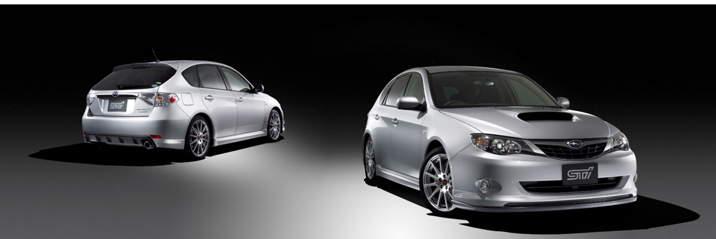
IMPREZA 5Door (GH)