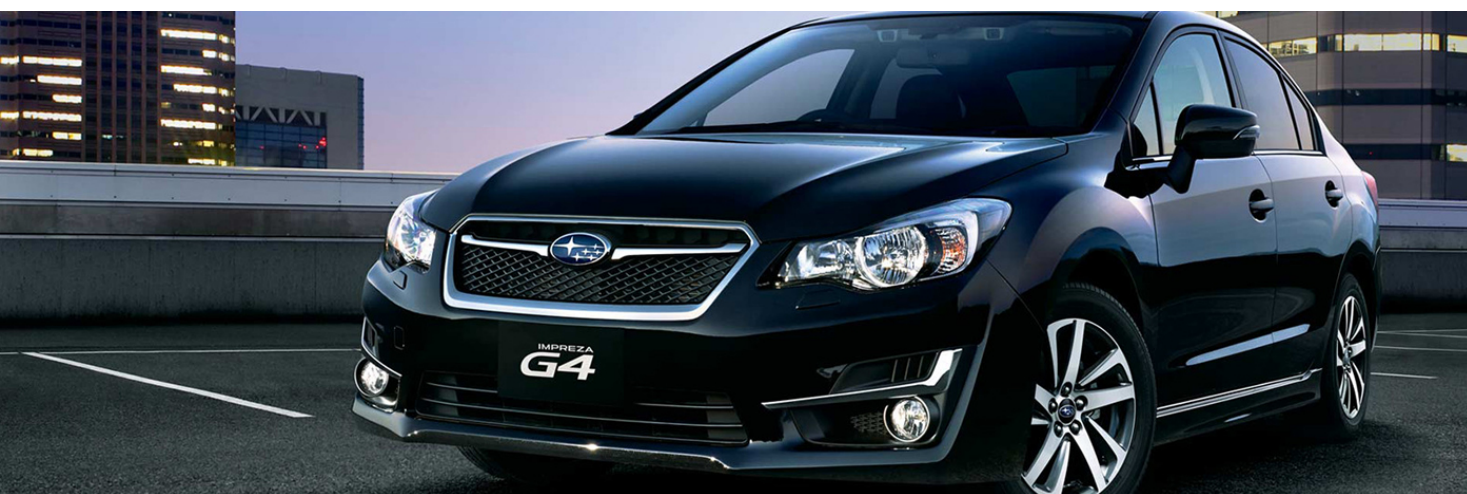
IMPREZA 4Door (GJ)